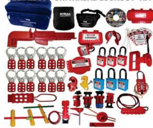
KRM LOTO-K-ULK KIT

Model no. : KRM-K-ULK Quantity : 1kit Weight : 5 Kg