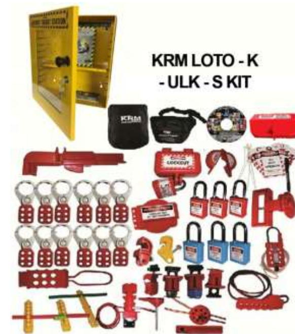
KRM LOTO - K - ULK - S KIT

Model no. : KRM-K-ULK-S Quantity : 1kit Weight : 9Kg