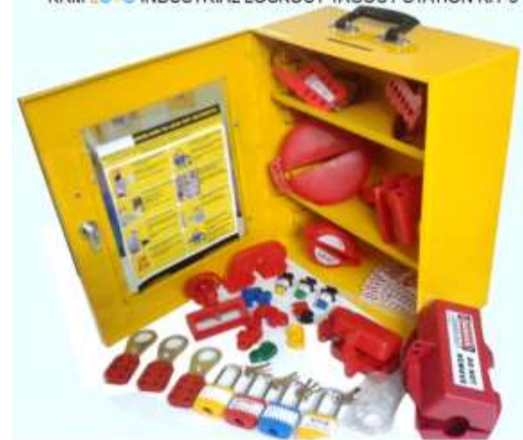
KRM LOTO INDUSTRIAL LOCKOUT TAGOUT STATION KIT-5

Model no. : KRM-K-ILTS K-5 Quantity : 1kit Weight : 8Kg