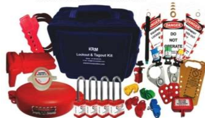
Mini Electro-Mech. Kit