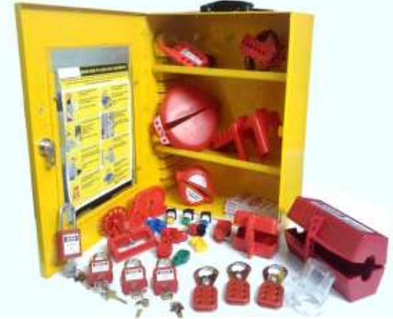
KRM LOTO INDUSTRIAL LOCKOUT TAGOUT STATION KIT-4

Model no. : KRM-K-ILTS K-4 Quantity : 1kit Weight : 8 Kg