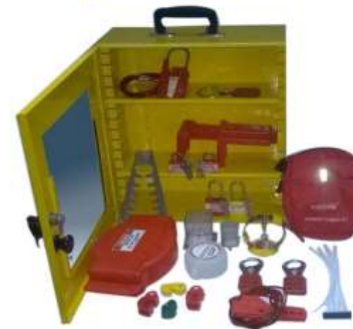
KRM LOTO - LOCKOUT TAGOUT STATION KIT-10

Model no. : KRM-K-LTSK-10 Quantity : 1kit Weight : 7 Kg