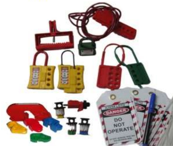
KRM LOTO – CIRCUIT BREAKER LOCKOUT KIT -1

Model no. : KRM-K-LTCBK-1 Quantity : 1kit Weight : 1 Kg