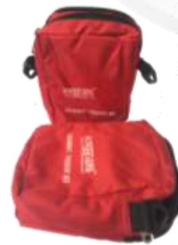
KRM-K-LTP-R (WITH SHOULDER BELT)