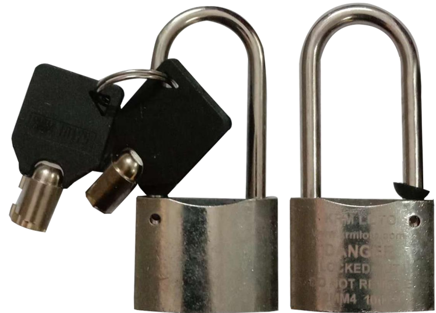
STANDARD ENGRAVED ALPHABETS & NUMERICAL NUMBER ON LOCK BODY & KEY HEAD.