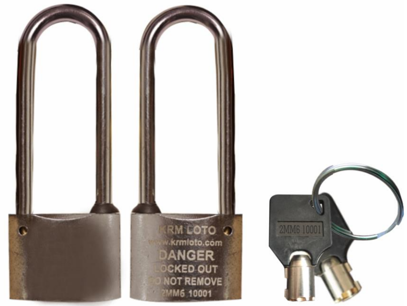
STANDARD ENGRAVED ALPHABETS & NUMERICAL NUMBER ON LOCK BODY & KEY HEAD.