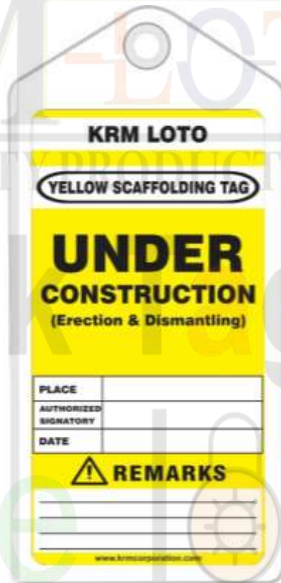
KRM-K-SCTL-M # 10257