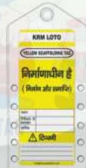
KRM-K-SCTL-M # 10260

KRM CORPORATION OSHAS 18001:2007 & BS EN ISO 9001 : 2008 CERTIFIED to meet OSHA's Lockout Tagout Standard 29 CFR, 1910.147&1910.269