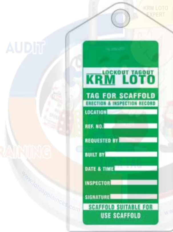
KRM-K-SCTL-M # 10258