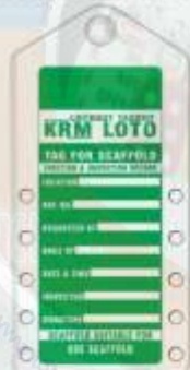
KRM-K-SCTL-M # 10261