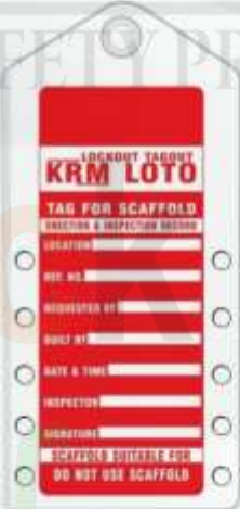
KRM-K-SCTL-M # 10259