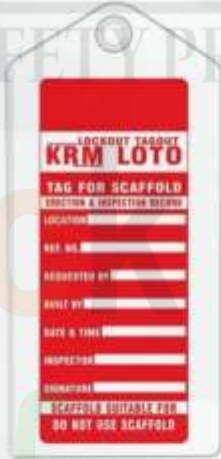
KRM-K-SCTL-M # 10256