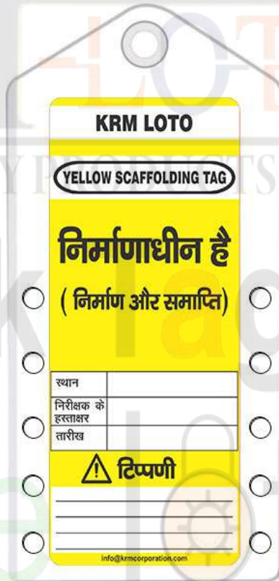
KRM-K-SCTL-M # 10260