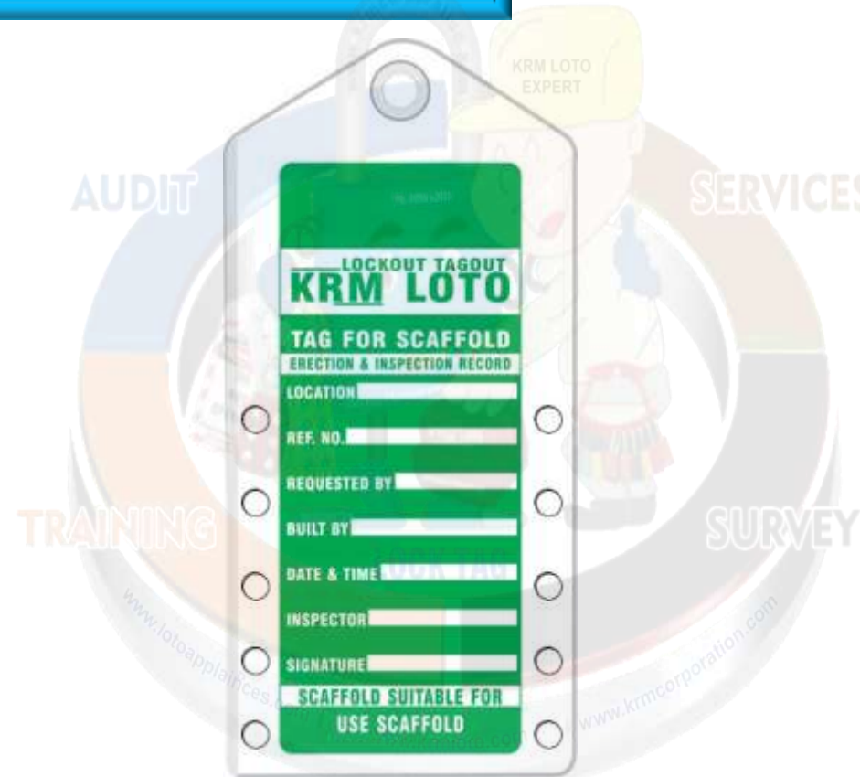
KRM-K-SCTL-M # 10261