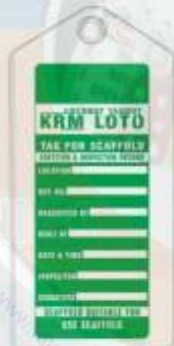
KRM-K-SCTL-M # 10258